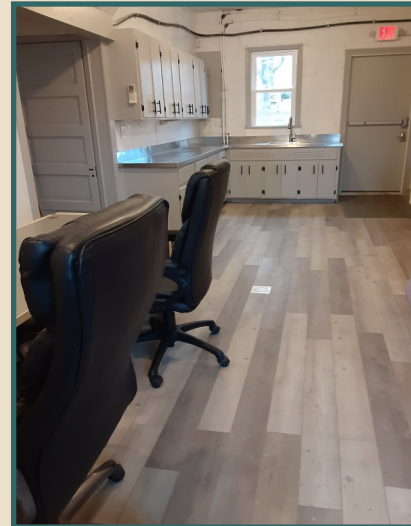
Partial View of Office and Research Room with Conservation/Preservation Area (Counters and Sink)

A special event you won't want to miss is the upcoming Grand Opening on Saturday, July 15th, complete with hors'd'oeuvres, entertainment and Guests of Honor.