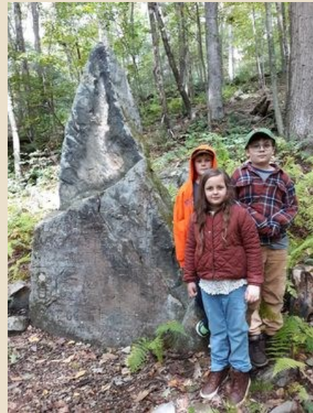
Wood Nymphs in the Park

To arrange a Special Tour or Program of the Park, Call us at the History Center 814-849-0077 or email kburkett-jchc@windstream.net or klyons-jchc@windstream.net . Don't forget to check our website, jchconline.org and facebook/jchconline for updates. Also find us on Instagram.com/jchconline .