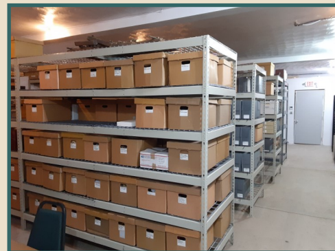
1st Floor Storage in Archival Boxes