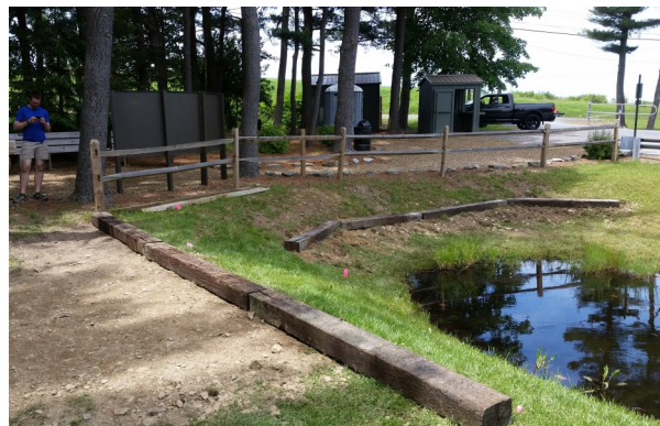
Terracing of the pond area begins.