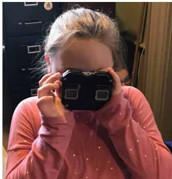
I see something really interesting in there!