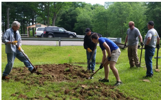
SRHP Crew: Phase I. Leveling the ADA area.

JCHC has had many requests to provide handicapped access at the Park. Our current priorities at the park are: (1) Developing an ADA accessible trail accommodating handicapped, seniors and others using ambulatory assistance devices or with ambulatory difficulties; (2) Providing an environmental setting accessible to those with special needs, where they can enjoy nature and participate easily in our outdoor environmental educational programs.