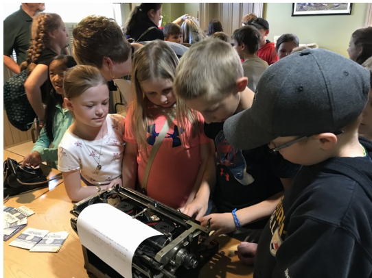
Typing Class 101A