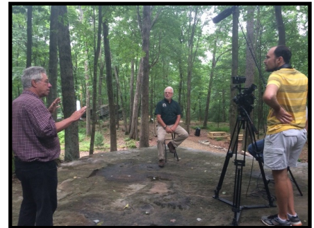
The park was recently covered on the ABC-WATM 23 Kaleidoscope program.

We sincerely wish to thank the Humphrey Land Trust and Winner Global LLC for permitting the property to be developed, every donor who contributed financial or in-kind support to this project, and lastly the many volunteers who have worked so hard to create the park and help to maintain it for our visitors.