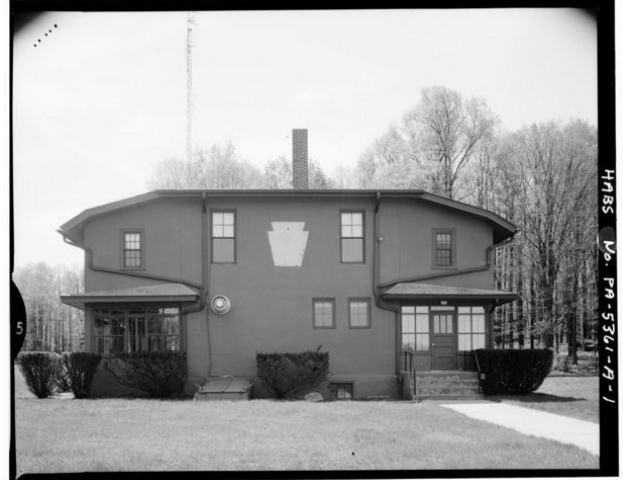
This view of the north entrance to the PA Game Commission's original School of Conservation

In early 1936 the Game Commission announced it was looking for men between the ages of 21 and 40 to become "student officers," the school's first class. More than 2,000 men asked for information on the school and nearly half of them filed applications. From this field of candidates, 434, representing every county, were chosen to compete in entrance examinations.